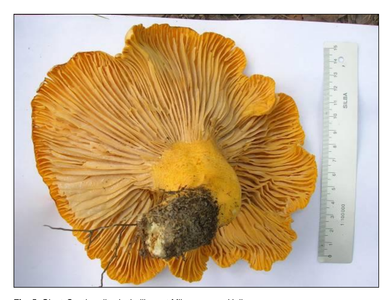
Fig. 5. Giant Cantharellus isabellinus at Mihaane near Hulia.

Russulaceae: This family is the richest in species with 5 Lactarius species and 7 Russula species.