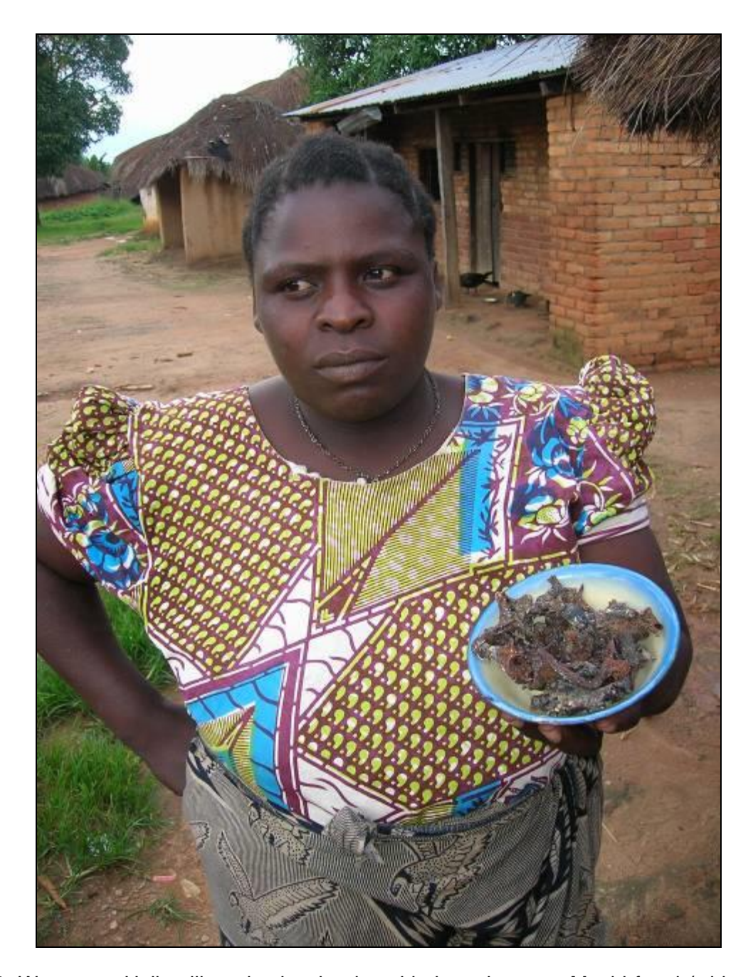
Fig. 8. Woman at Hulia village is showing her dried mushrooms. Mould fungi (white spots) are visible on the dried mushrooms.