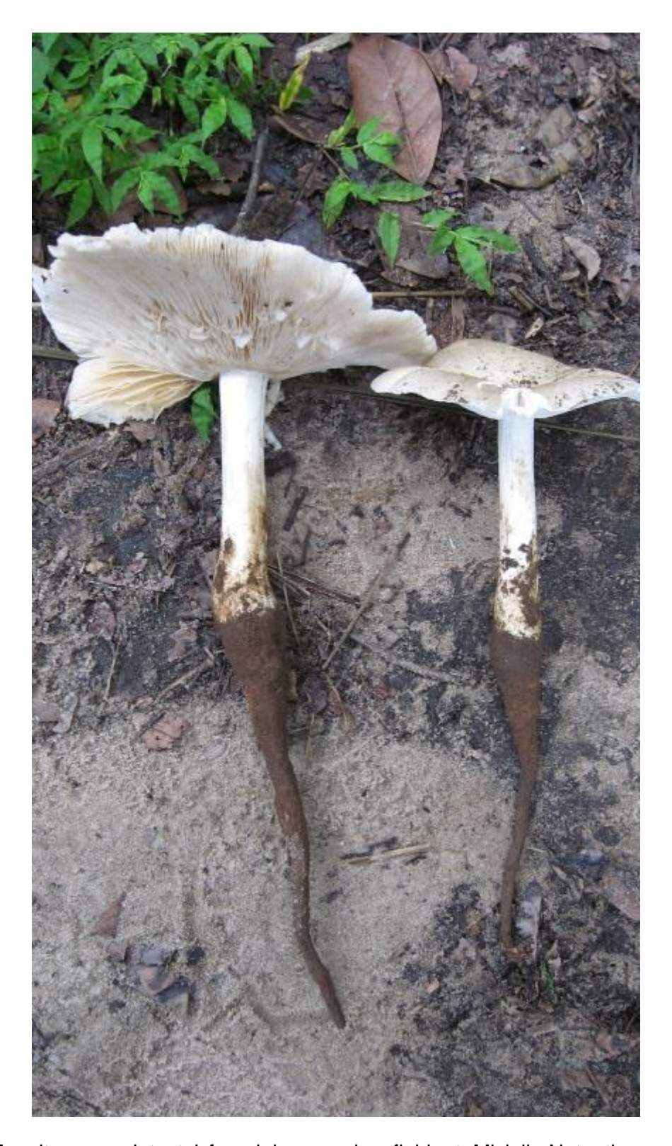
Fig. 6. Termitomyces letestui found in a maize field at Mislaji. Note the underground pseudorrhiza, a root-like extension of the stipe, connected to the fungus comb in an underground termite nest.

Tricholomataceae: Only at Mislaji we found several species of the conspicuous termite mushroom Termitomyces letestui in agricultural fields nearby termite mounds (see Fig. 6). This tropical genus is typified by its symbiotic life together with termites. The local communities recognised four Termitomyces species according to Härkönen et al. (2003).