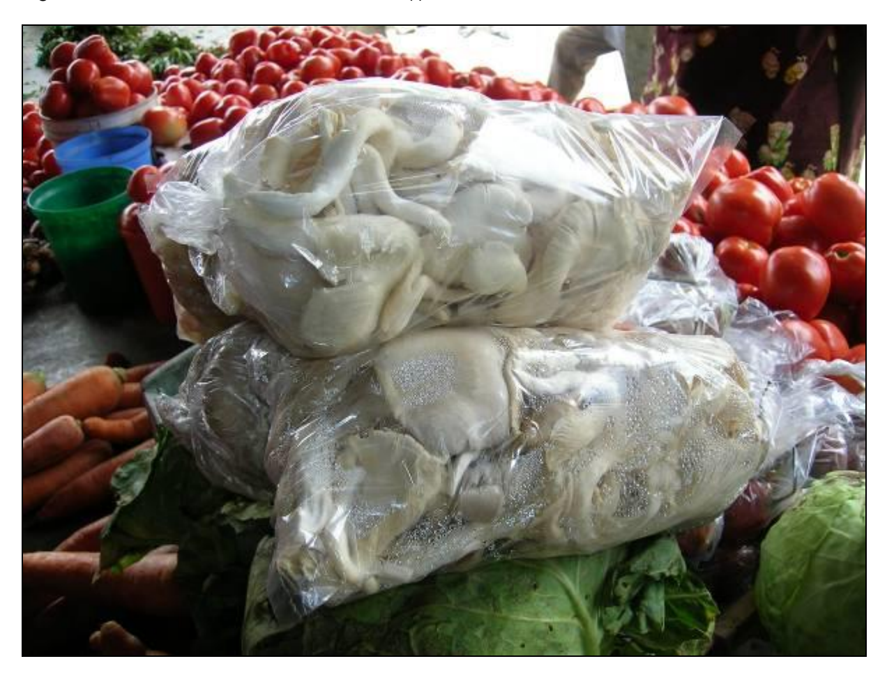
Fig. 9. Pleurotus sp. sold at Uhindini market at Songea.

Cantharellus platyphyllus/symoensii, Lactarius edulis, and Russula cellulata. The most common species in the markets of Iringa are Cantharellus sp Amanita loosii. In the Uhindini market at Mbeya, cultivated Pleurotus sp. (see Fig. 9) were sold at a price about three times higher than that of wild edible mushrooms (!).