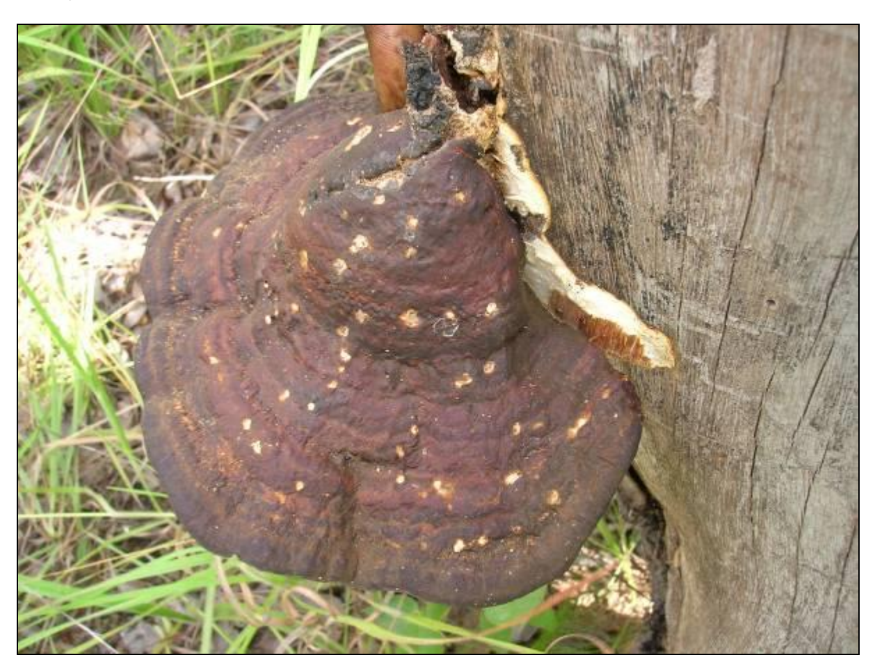
Fig. 7. Powder of this Ganoderma sp. growing on trunk of Brachystegia spiciformis at Darajambili is used by the locals for treating cough and asthma.

In addition to the powder of the polypore Ganoderma sp. which is used in the Magazini area for treating cough and asthma (see details Bloesch & Mbago 2008), we found another polypore during the second fieldtrip which is used for the same medicinal purposes (see Fig. 7). Moreover, the staff of the SNWC Project showed us a third species of Ganoderma sp. from the Corridor from which the people are using its powder to treat skin diseases. In addition, one villager from Huria told us the mushroom called Ndongamo is used to treat teeth problems.