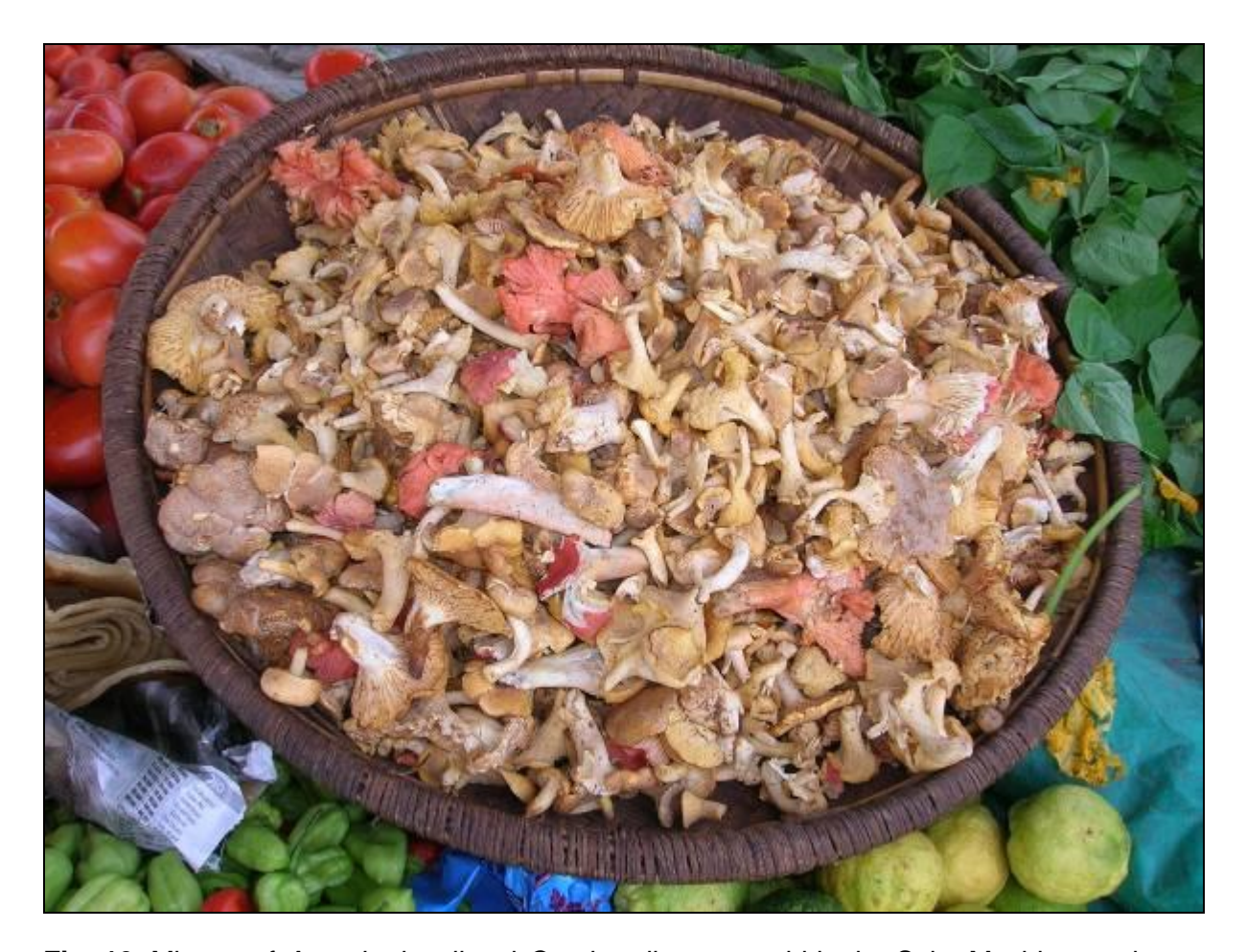
Fig. 10. Mixture of Amanito loosii and Cantharellus spp. sold in the Soko Mashine market at Songea. The pinkish chanterelle is C. ruber .

A mushroom flyer in English with coloured photographs of the most important edible mushrooms of the Corridor was elaborated together with the design office Zone 2 in Switzerland and printed by Graphic Solutions in Dar es Salaam (Bloesch 2009). The flyer aims to support the promotion of mushroom having a high nutritional value by documenting and illustrating the rich potential of wild edible mushrooms in the Corridor. It includes also instructions regarding sustainable harvesting, proper picking techniques, identification of mushrooms, containers for the foray, and appropriate drying techniques. This first English version targets the English spoken audience (authorities, technical services, private sector, hotels, developing agencies, donors...). The English version will be translated in easy Swahili for the local communities of the Corridor who will be the main beneficiaries of the mushroom project.