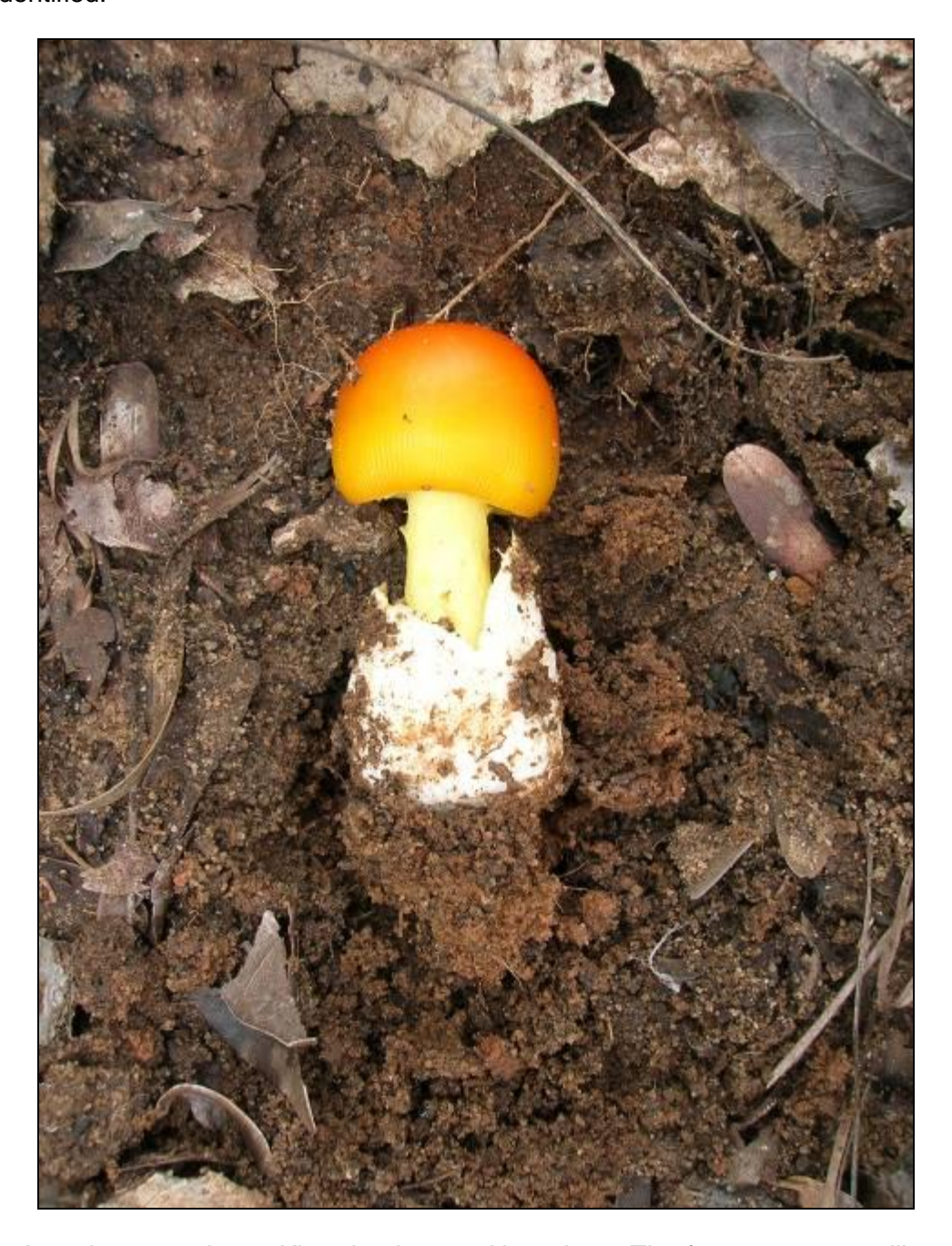
Fig. 4. Amanita tanzanica at Kirundunda near Namwinyu. The fungus emerges like a white egg, before splitting at the apex to reveal the cap.

Cantharellaceae: Chanterelles are the prominent species of the miombo woodlands of the Corridor and very abundant, in particular C. isabellinus (see Fig. 5). In total six species have been identified.