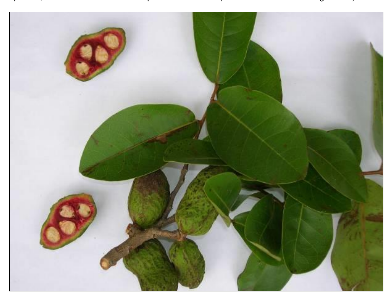
Fig. 11. Hexalobus monopetalus at Likusanguse village.

In addition, opportunistic sampling of the vegetation throughout the second fieldtrip allowed us to collect and identify new plants for completing the plant checklist of the Selous-Niassa Wildlife Corridor. The checklist includes now more than 500 plant taxa whereof 6 endemic species, 14 orchids and two new species to science (see also Bloesch & Mbago 2008).