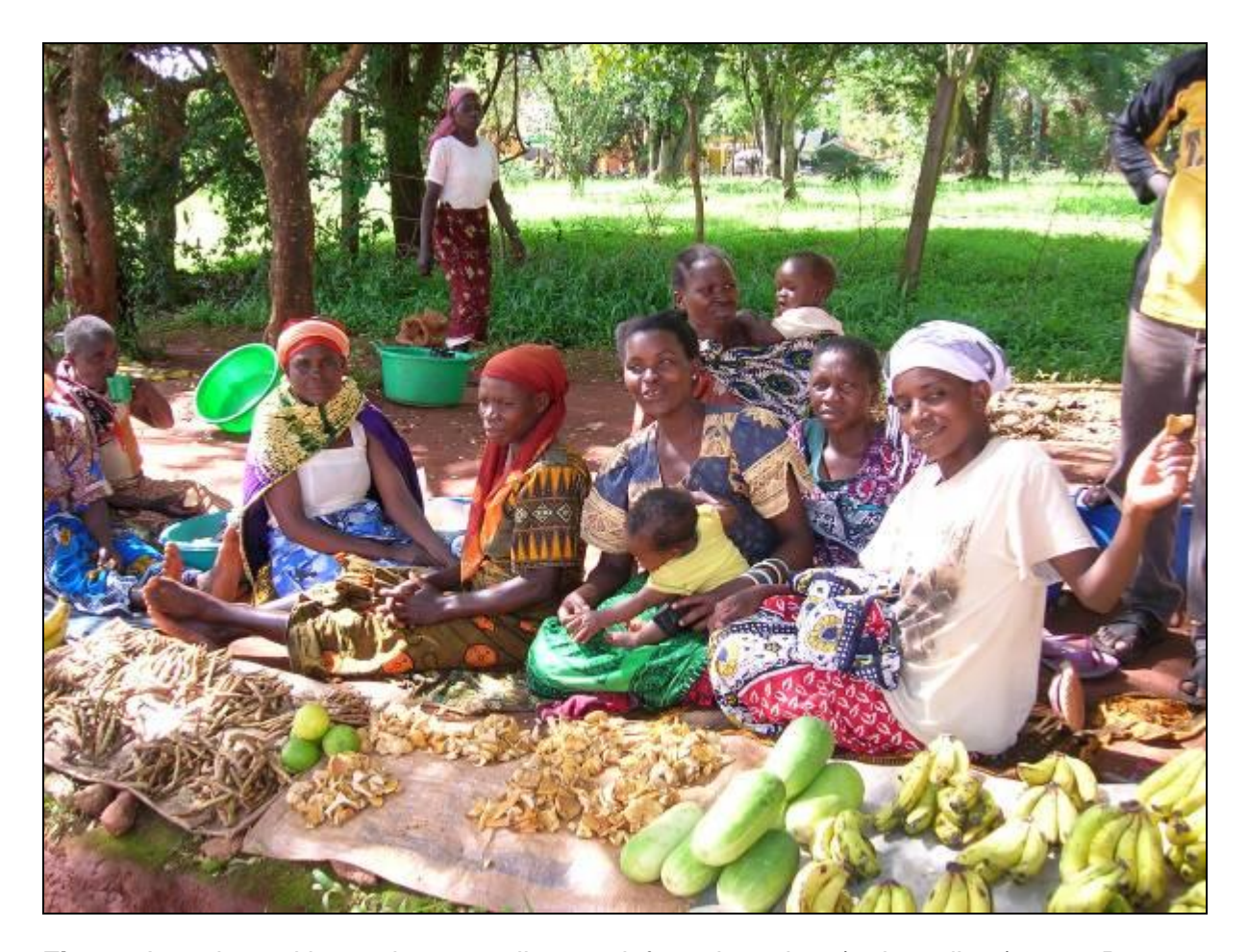
Fig. 3. Interview with mushroom sellers at informal market ( soko mjinga ) near Ruvuma Regional Hospital at Songea.